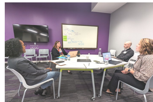
Kate Spahr Consulting LLC at work